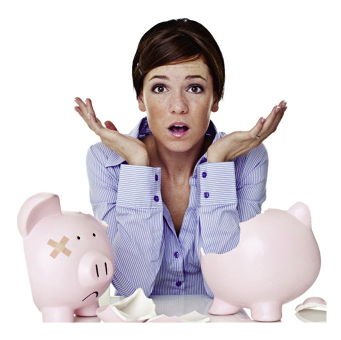
Topics for both telephone and in-person consultations include but are not limited to:

• In-person consultation – Once per quarter, a Stacey Braun planner will be available at a predetermined location for in-person consultations.